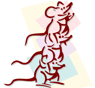
Thank you for your help!