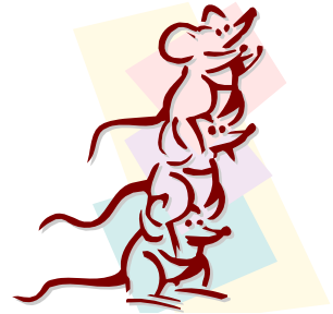
Thank you for your help!