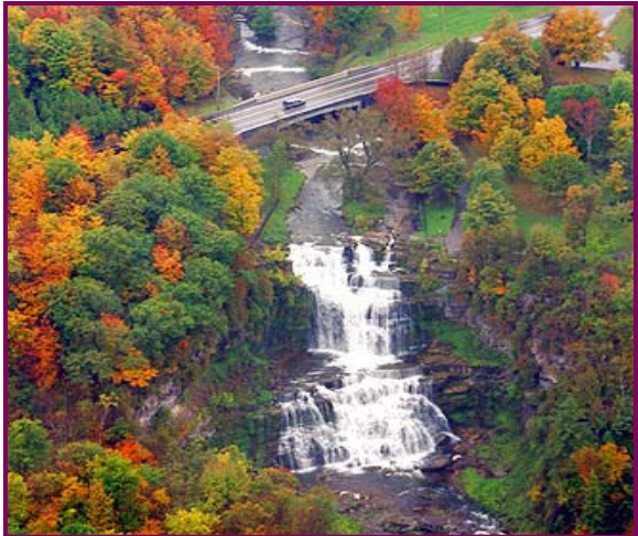
Chittenango Falls State Park in Cazenovia